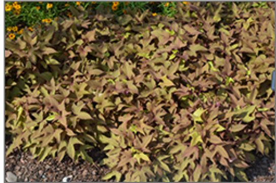
Sidekick Heart Bronze Sweet Potato Vine