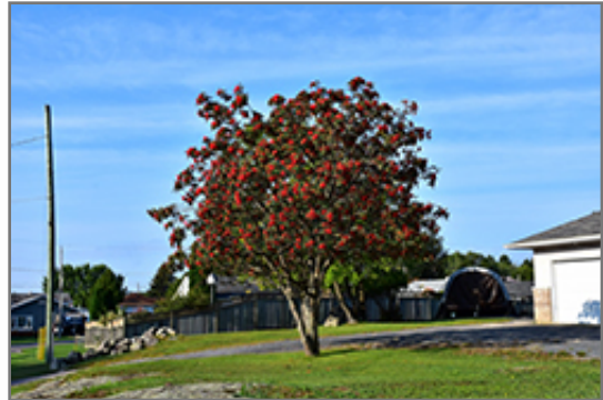
Showy Mountain Ash fruit