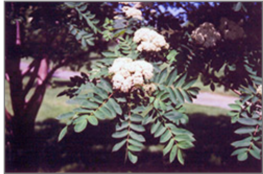
Showy Mountain Ash flowers

This tree should only be grown in full sunlight. It is very adaptable to both dry and moist locations, and should do just fine under average home landscape conditions. It is not particular as to soil type or pH. It is highly tolerant of urban pollution and will even thrive in inner city environments. This species is native to parts of North America.