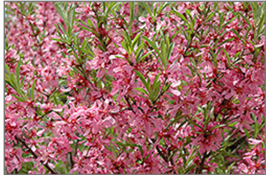
Russian Almond flowers