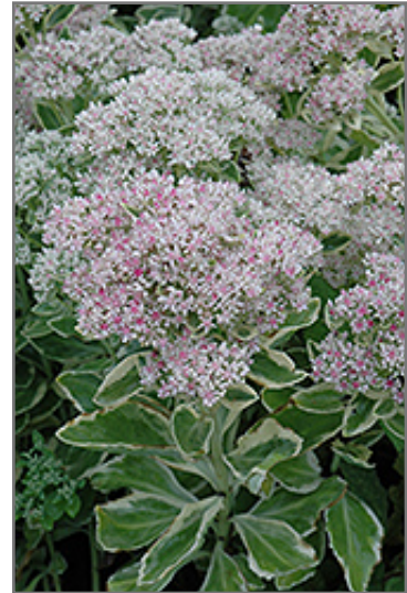
Frosty Morn Stonecrop flowers