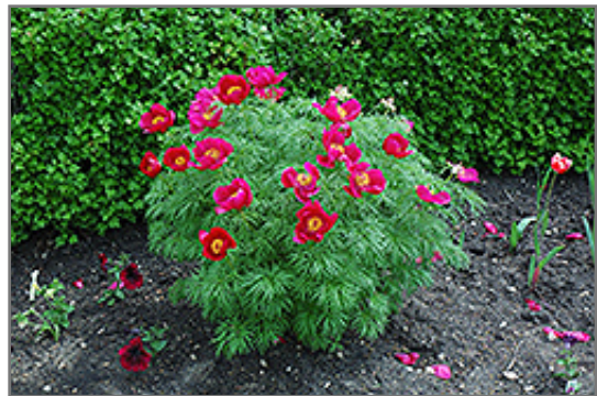
Japanese Fernleaf Peony in bloom