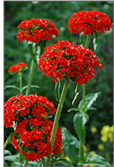
Maltese Cross flowers