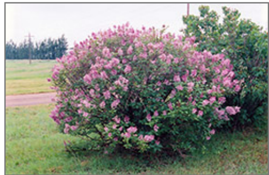
Miss Canada Preston Lilac in bloom