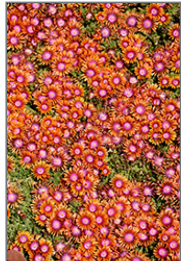
Fire Spinner Ice Plant flowers