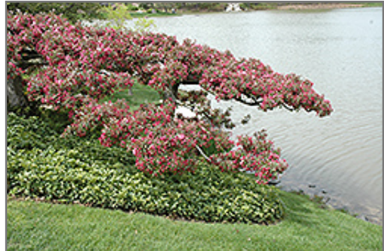
Candied Apple Flowering Crab in bloom