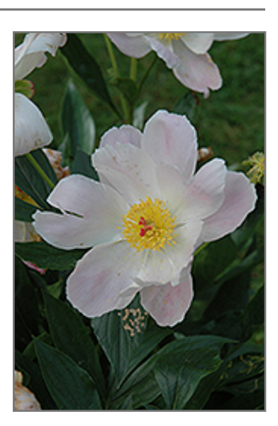
Duchess of Portland Peony flowers

Duchess of Portland Peony will grow to be about 30 inches tall at maturity, with a spread of 3 feet. When grown in masses or used as a bedding plant, individual plants should be spaced approximately 30 inches apart. The flower stalks can be weak and so it may require staking in exposed sites or excessively rich soils. It grows at a slow rate, and under ideal conditions can be expected to live for approximately 20 years. As an herbaceous perennial, this plant will usually die back to the crown each winter, and will regrow from the base each spring. Be careful not to disturb the crown in late winter when it may not be readily seen!