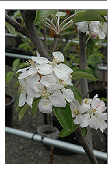
Spitzenburg Apple flowers