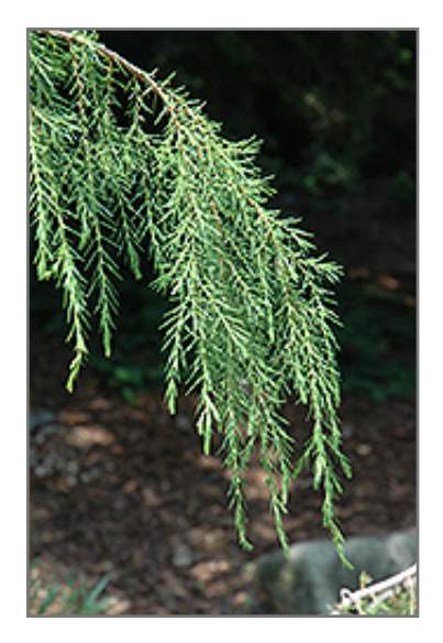
Needle Juniper foliage