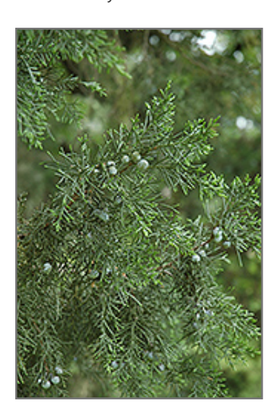
Keteleer Juniper foliage