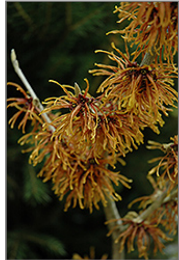
Jelena Witchhazel flowers