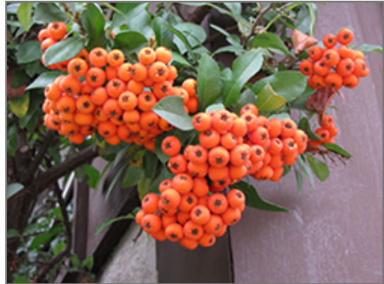
Lalandei Scarlet Firethorn fruit