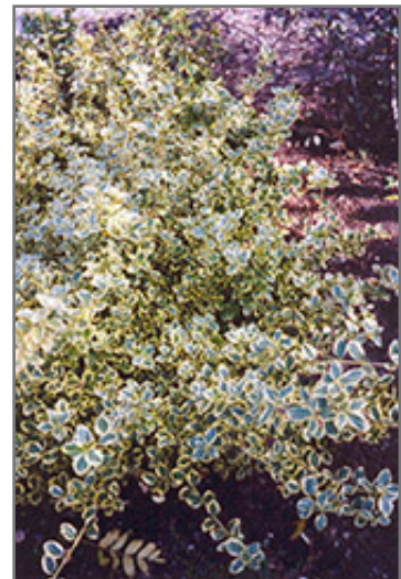
Canadale Gold Wintercreeper