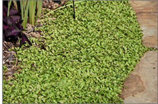
Creeping Mazus

Creeping Mazus will grow to be only 2 inches tall at maturity extending to 3 inches tall with the flowers, with a spread of 12 inches. Its foliage tends to remain low and dense right to the ground. It grows at a fast rate, and under ideal conditions can be expected to live for approximately 10 years. As an evergreen perennial, this plant will typically keep its form and foliage year-round.