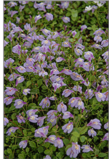
Creeping Mazus flowers

Creeping Mazus is recommended for the following landscape applications;