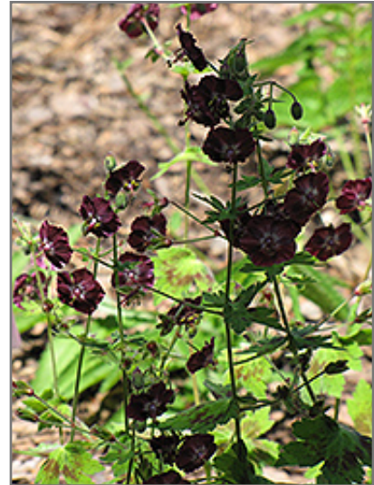
Samobor Cranesbill in bloom