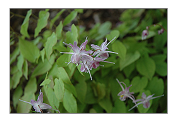
Bishop's Hat flowers