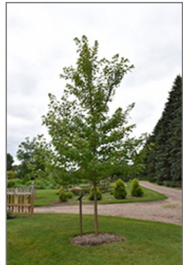
Matador Maple