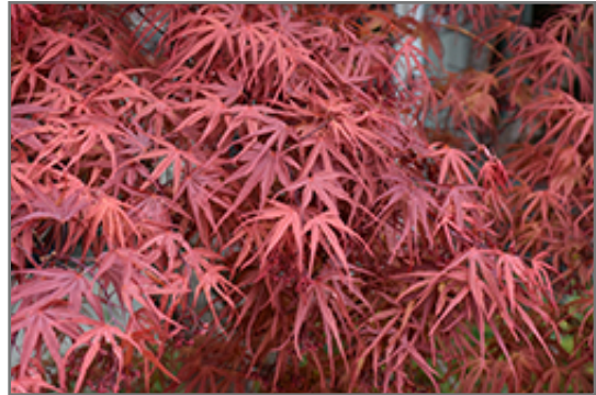
Beni Otake Japanese Maple foliage