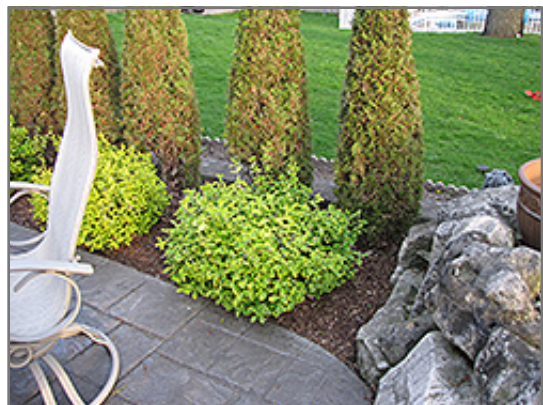
Country Gold Wintercreeper