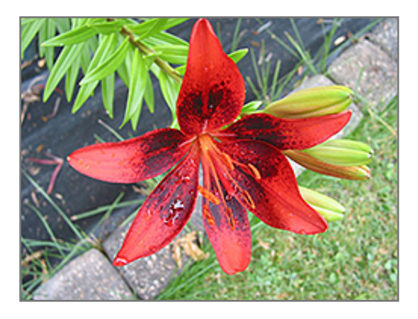
Pup Art Lily flowers