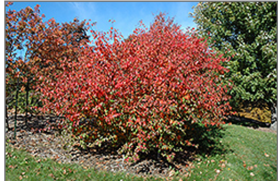
Korean Sun Pear in fall

Korean Sun Pear will grow to be about 15 feet tall at maturity, with a spread of 20 feet. It has a low canopy with a typical clearance of 2 feet from the ground, and is suitable for planting under power lines. It grows at a medium rate, and under ideal conditions can be expected to live for 50 years or more.