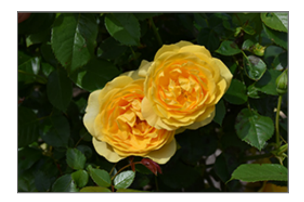
Julia Child Rose flowers