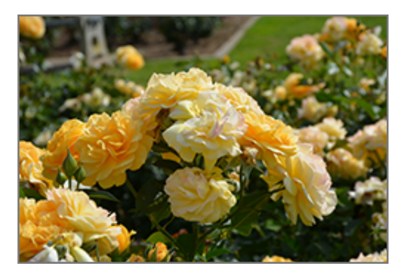
Julia Child Rose flowers