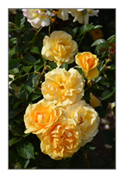
Julia Child Rose flowers

This shrub should only be grown in full sunlight. It does best in average to evenly moist conditions, but will not tolerate standing water. It is not particular as to soil type or pH. It is somewhat tolerant of urban pollution. This particular variety is an interspecific hybrid.