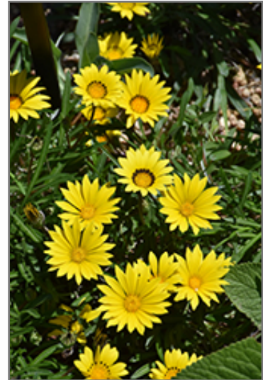
Colorado Gold Gazania flowers

Colorado Gold Gazania is recommended for the following landscape applications;