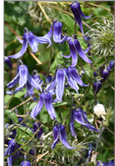
Solitary Clematis flowers

Solitary Clematis will grow to be about 3 feet tall at maturity, with a spread of 24 inches. It grows at a medium rate, and under ideal conditions can be expected to live for approximately 20 years. As an herbaceous perennial, this plant will usually die back to the crown each winter, and will regrow from the base each spring. Be careful not to disturb the crown in late winter when it may not be readily seen!