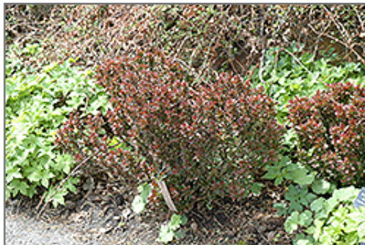
Bagatelle Japanese Barberry