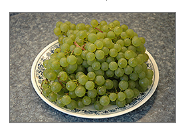
Morden 9703 Grape fruit

This is a dense multi-stemmed deciduous woody vine with a spreading, ground-hugging habit of growth. Its relatively coarse texture can be used to stand it apart from other landscape plants with finer foliage. This is a high maintenance plant that will require regular care and upkeep, and requires a special pruning regimen to reliably produce fruit; consult a specific reference guide or contact the store for proper pruning techniques. It is a good choice for attracting birds to your yard. Gardeners should be aware of the following characteristic(s) that may warrant special consideration;