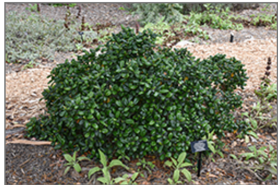
Leatherleaf Coffeeberry