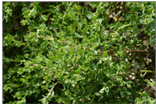
Santa Ana Coyote Brush foliage