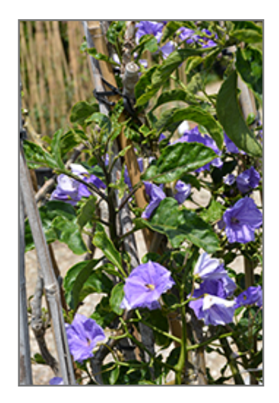
Giant Potato Creeper flowers