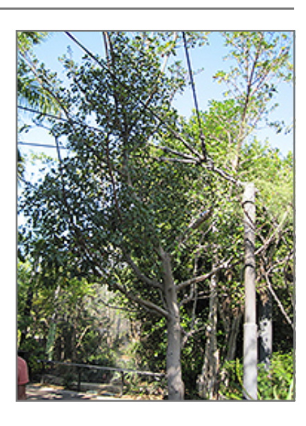
Forest Strangler Fig

Forest Strangler Fig has attractive dark green foliage with grayish green undersides on a tree with an upright spreading habit of growth. The small glossy oval sprays of foliage are highly ornamental but do not develop any appreciable fall colour. The fruits are showy yellow pomes with a scarlet blush, which are carried in abundance from early summer to late fall. The fruit can be messy if allowed to drop on the lawn or walkways, and may require occasional clean-up. The smooth gray bark is extremely showy and adds significant winter interest.