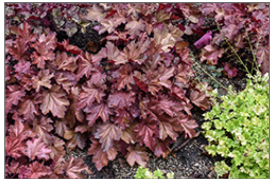
Magma Coral Bells