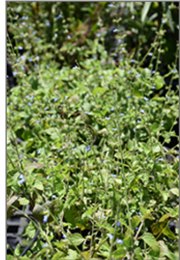
Southern River Sage flowers

Southern River Sage is recommended for the following landscape applications;