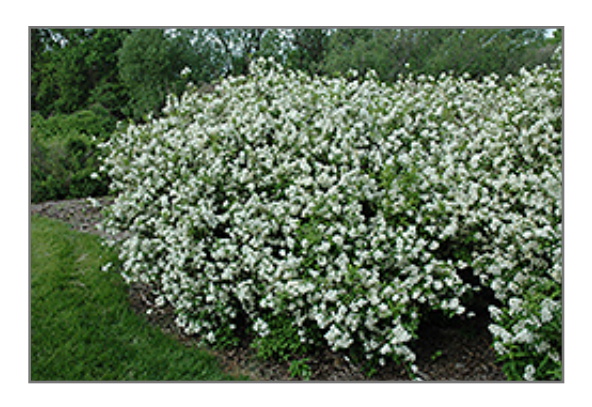
Mongolian Deutzia in bloom

This is a high maintenance shrub that will require regular care and upkeep, and should only be pruned after flowering to avoid removing any of the current season's flowers. It has no significant negative characteristics.