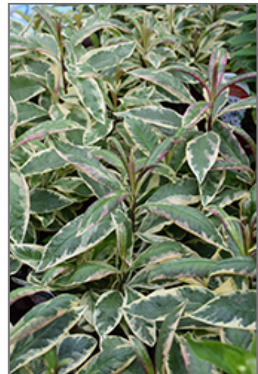
Olympus Garden Phlox foliage