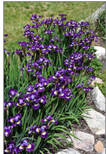
Jewelled Crown Siberian Iris in bloom