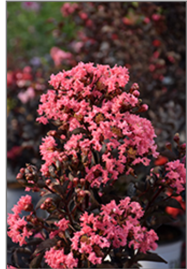
Center Stage Coral Crapemyrtle flowers