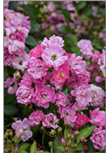
Pretty Polly Pink Rose flowers