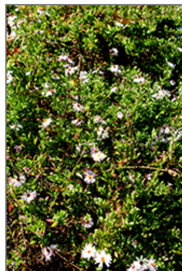
Climbing Aster flowers

Climbing Aster is recommended for the following landscape applications;