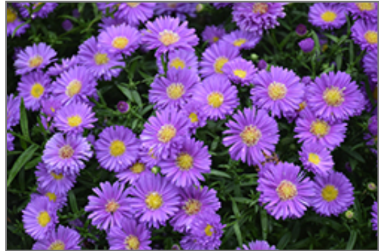
Magic Purple Aster flowers

Magic Purple Aster is recommended for the following landscape applications;