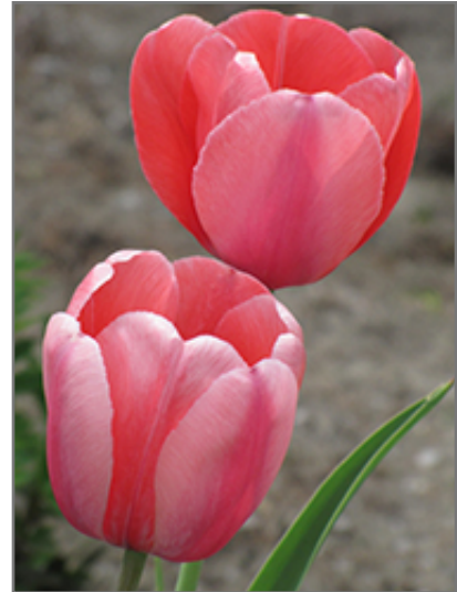
Pink Impression Tulip flowers