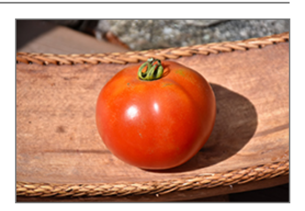
Siletz Tomato fruit