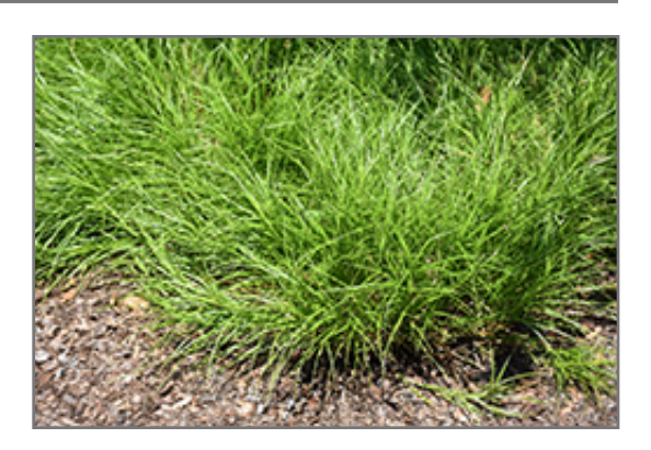
Bicknell's Sedge