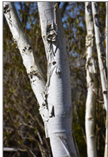
Filigree Lace European Birch bark