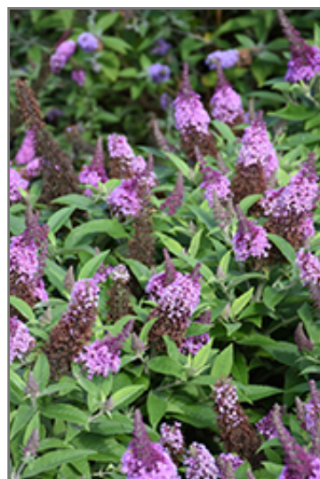
Chrysalis Pink Butterfly Bush flowers