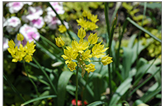
Golden Garlic flowers