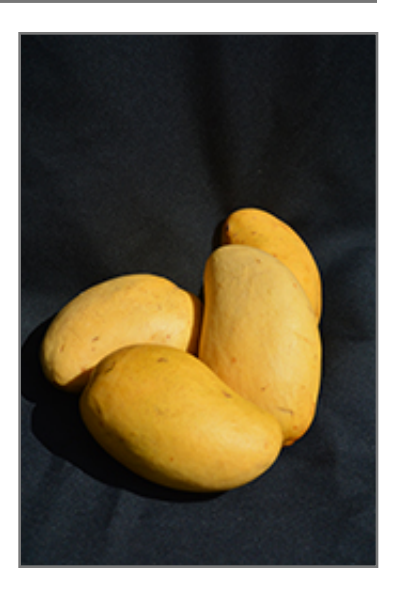
Ataulfo Mango fruit