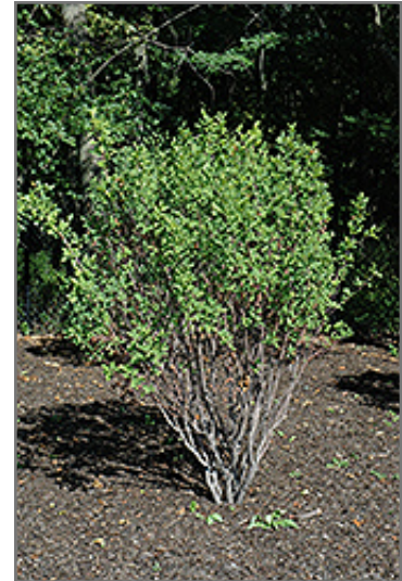
Rainbow Pillar Serviceberry

Rainbow Pillar Serviceberry is recommended for the following landscape applications;